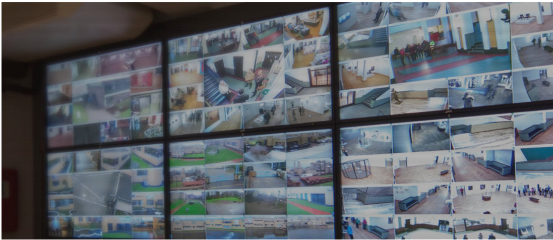
A look at the control room of a video surveillance project deployed by Videotronic.