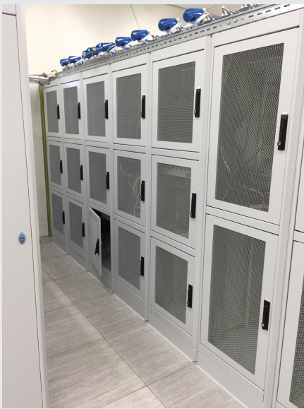
A look at the racks housing PROMISE FileCruiser at ICTeam, providing its customers with a private file synchronization and sharing solution.