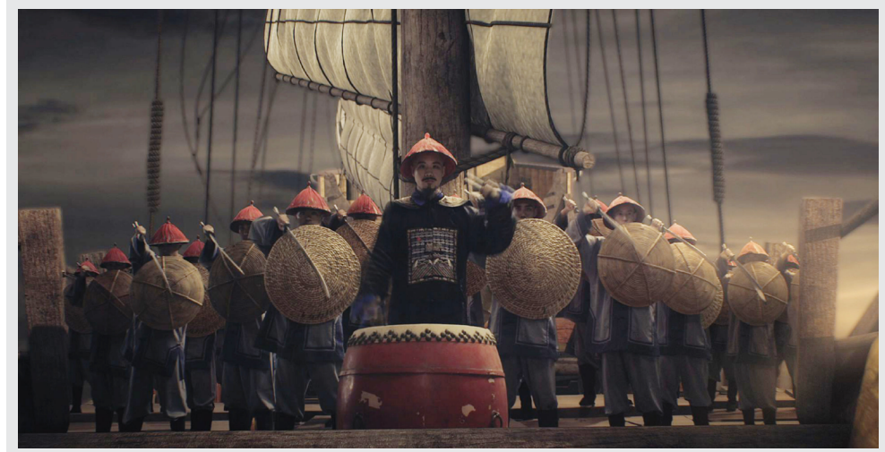
A scene from 'Rebuilding the Tongan Ships', Directed by Aaron Ke of Bronze Visual Art